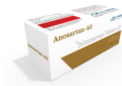
ANOSARTAN-40 (Telmisartan 40 MG)