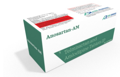
ANOSARTAN-AM (Telmisartan (40 MG) + Amlodipine (5 MG))