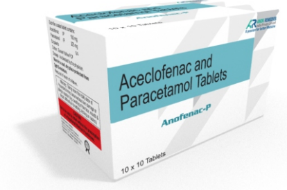
ANOFENAC-P (Aceclofenac + Paracetamol)