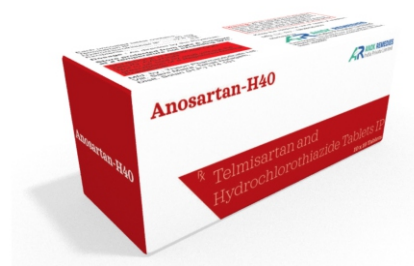
ANOSARTAN-H40 (Telmisartan (40 MG) + Hydrochlorothiazide (12.5 MG))