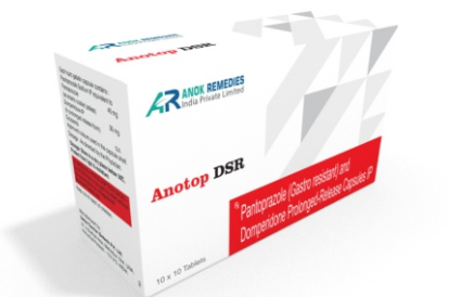
ANOTOP DSR (Pantoprazole + Domperidone SR)