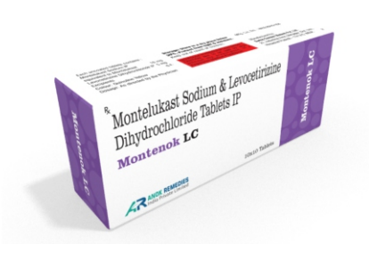
MONTENOK LC (Montelukast 10 MG + Levocetirizine 5 MG)