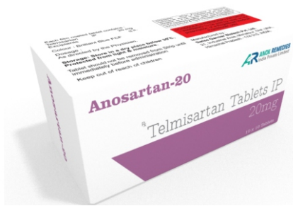
ANOSARTAN-20 (Telmisartan 20 MG)